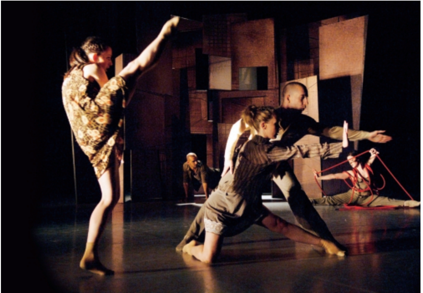
Homo ludens nomadic machines

Sharon Eyal has performed with Batsheva Dance Company for more than a decade. From being a leading dancer, a source of inspiration to choreographers and creators, she grew up to be a talented choreographer with a unique and personal language.